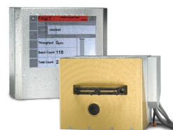
Videojet IP DataFlex Plus TTO

Videojet IP65 and IP66 rated coders are designed for washdown environments and utilise superior 316 grade stainless steel. Contact Videojet to discuss your variable coding needs today.